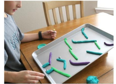
Marbles + Play Dough STEM Challenge

https://frugalfun4boys.com/marbles-play-dough-stem-challenge/